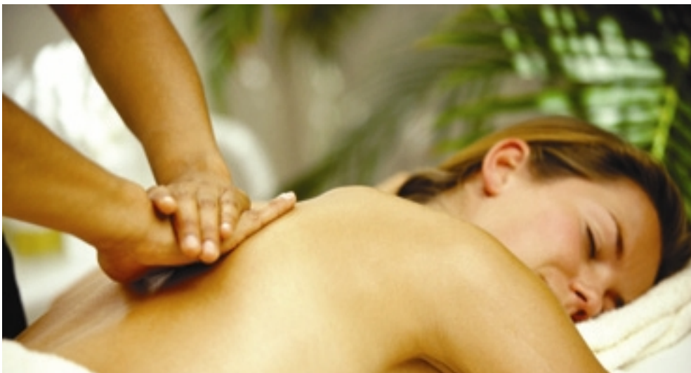
The more often you receive massage, the more therapeutic it becomes.

How often you receive massage depends on why you're seeking massage. In dealing with the general tension of everyday commutes, computer work, and time demands, a monthly massage may be enough to sustain you. On the other hand, if you're seeking massage for chronic pain, you may need regular treatments every week or two. Or if you're addressing an acute injury or dealing with high levels of stress, you may need more frequent sessions. Your situation will dictate the optimum time between treatments, and your practitioner will work with you to determine the best course of action.